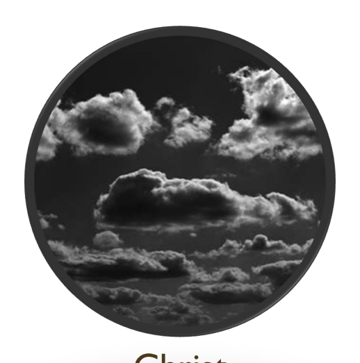
Christ Isaiah 53:3