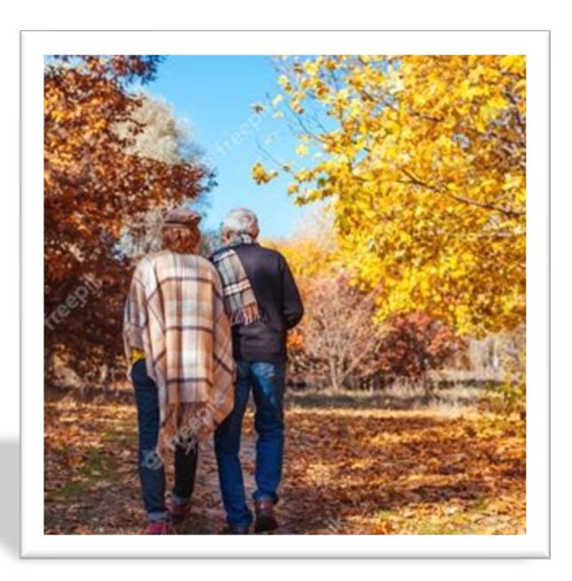
Sleep Food Exercise