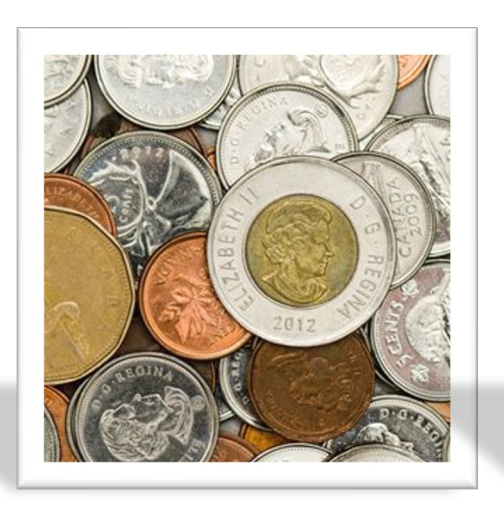
Money All From God