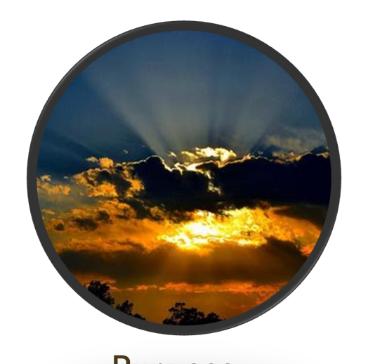
Purpose Romans 5:3-5