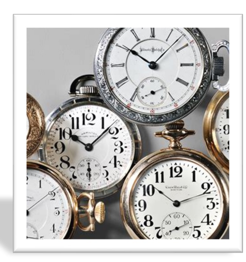
Time Redeem the Time