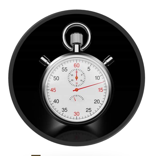
Temporary 2 Corinthians 4:16-18