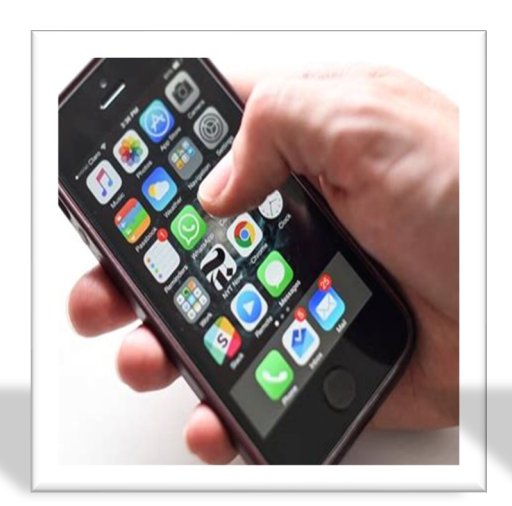
Technology The Good, The Bad, & The Ugly