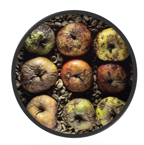
Sin Fruit Genesis 2:17, 3:16-19