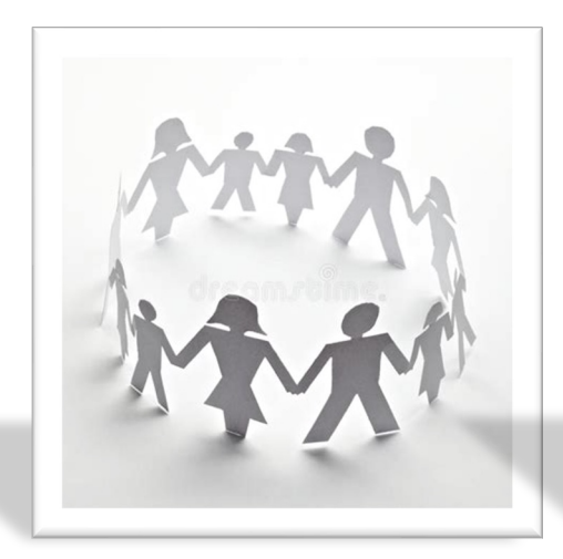
Relationships We Need Each Other