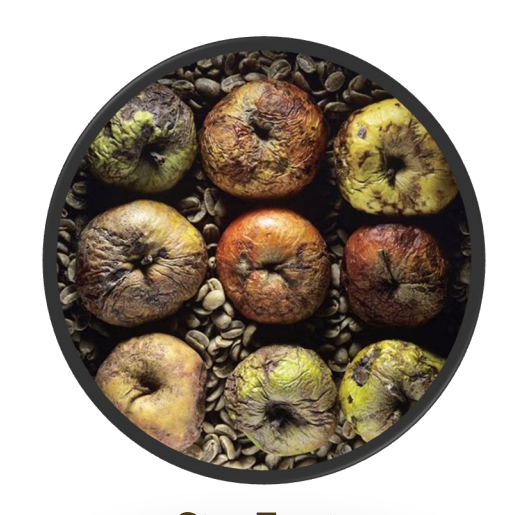
Sin Fruit Genesis 2:17, 3:16-19