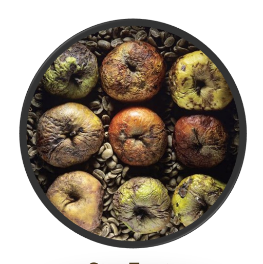
Sin Fruit Genesis 2:17, 3:16-19