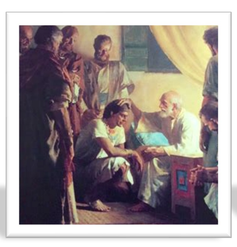
Jacob Genesis 48 & 49