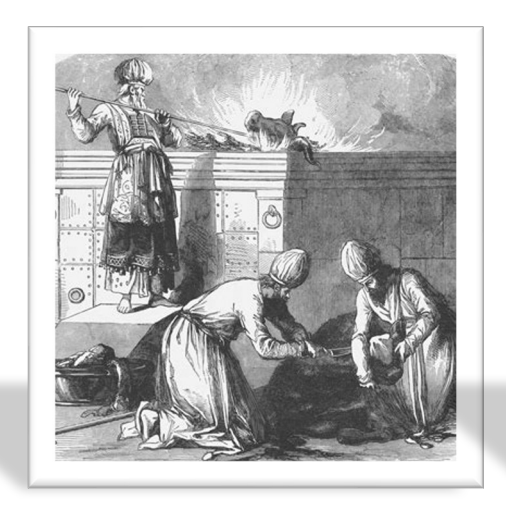
Retirement Numbers 8:23-26