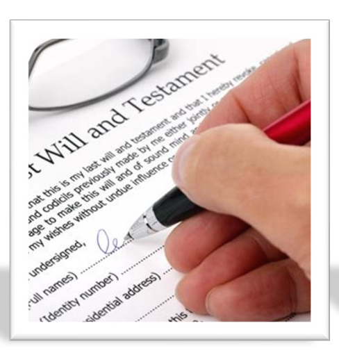
Prepare Genesis 25:5-11