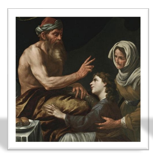
Isaac Genesis 27 & 28