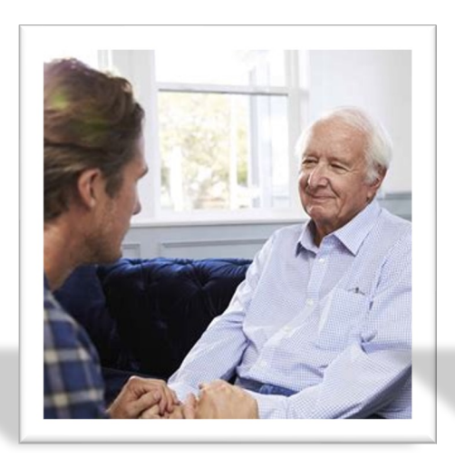
Long-Term Care Ephesians 6:2-3