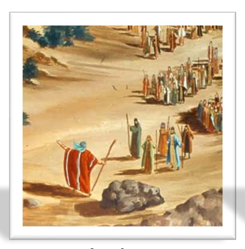
Joshua Joshua 23 & 24