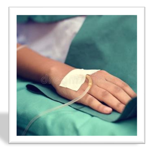
Dying Job 14:1-5