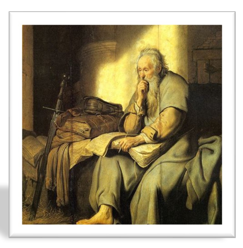
Paul 2 Timothy 4