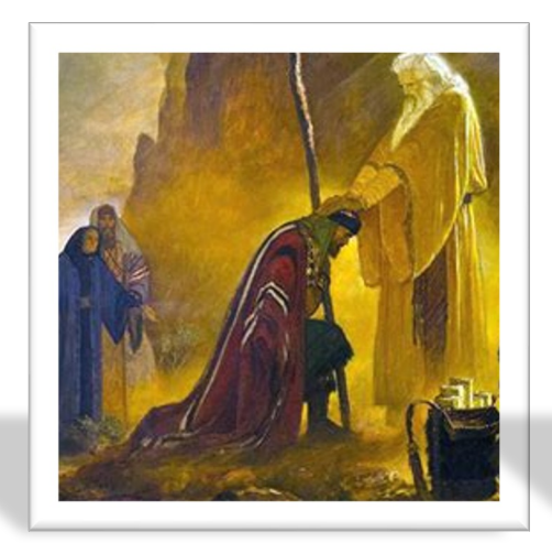
Moses Deuteronomy 31