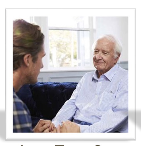
Long-Term Care Ephesians 6:2-3