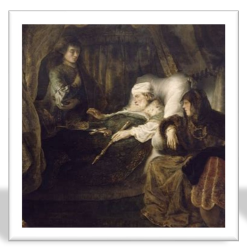
David 1 Chronicles 28 & 29