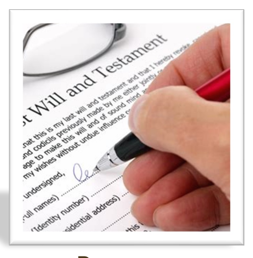
Prepare Genesis 25:5-11