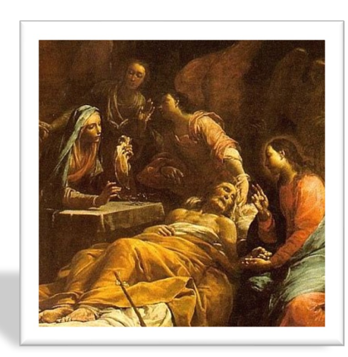
Joseph Genesis 50