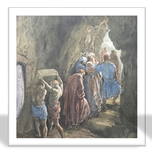
Abraham Genesis 23 & 25